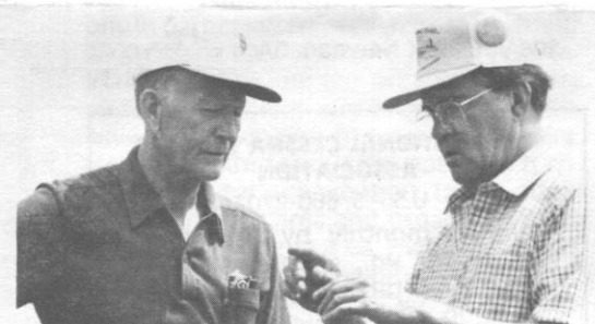
From the inside looking out.