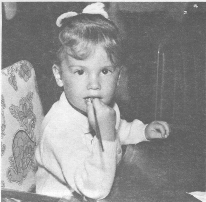
Everyone enjoyed the buffet dinner at Westhaven Country Club.