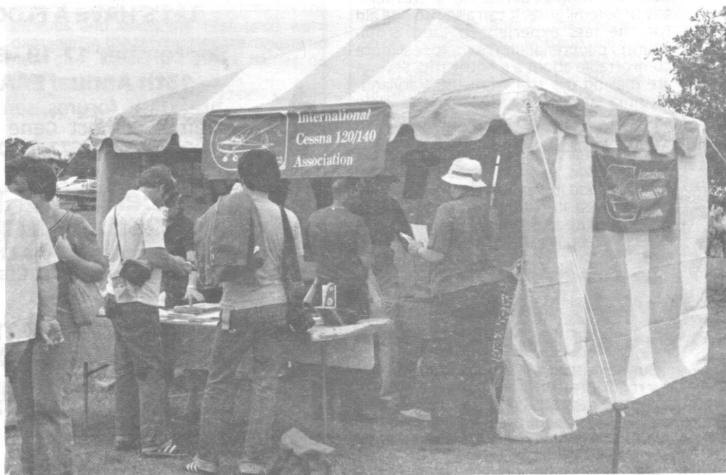
The Tent was a busy place.