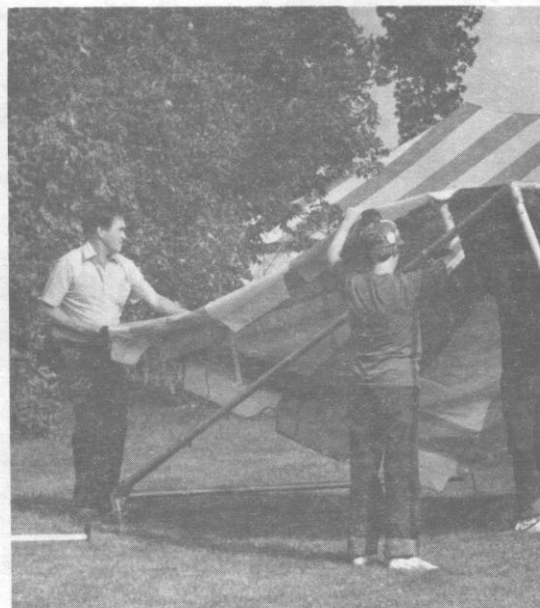
The Tent went up with e