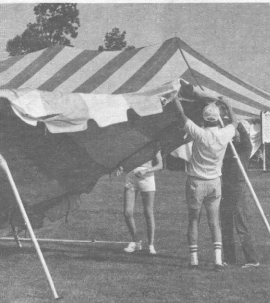
se - and lots of help.